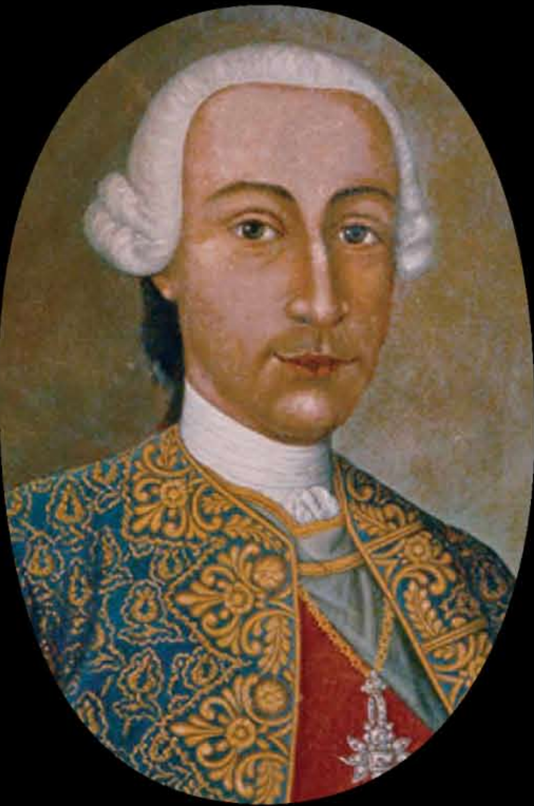
Charles III Pablo Antonio García del Campo (1744-1814) 1770 Oil painting on canvas 98 x 82cm Museo Nacional de Colombia Reg. 529

well known by their prestigious medical academy centers. However, he preferred to embark towards America, as the Viceroy's doctor. With a sharp traveler's spirit and scientific training, he departed from Europe in 1760, at the age of 28, towards a new continent from where he was not to return.