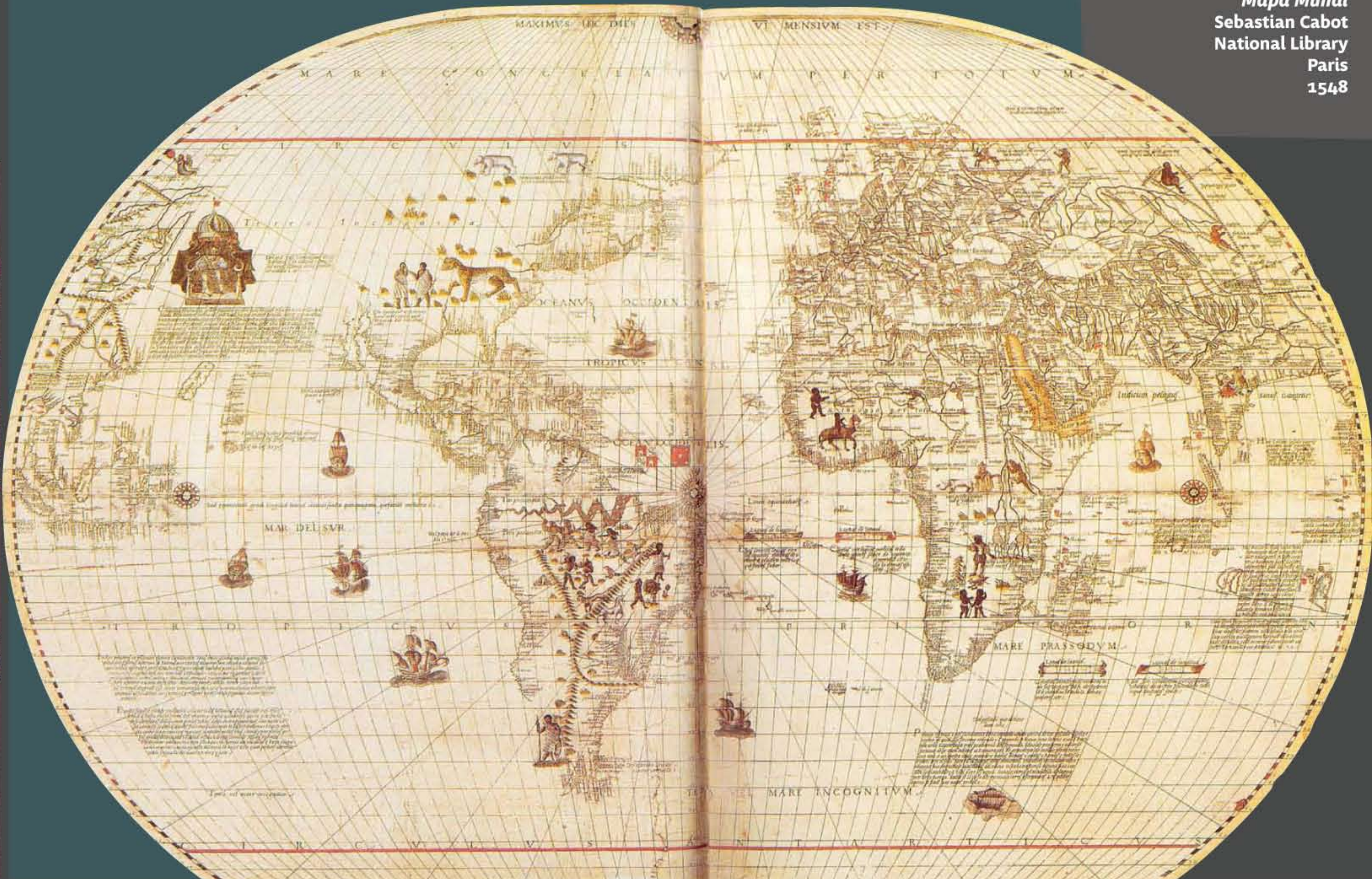
Mapa Mundi Sebastian Cabot National Library Paris 1548